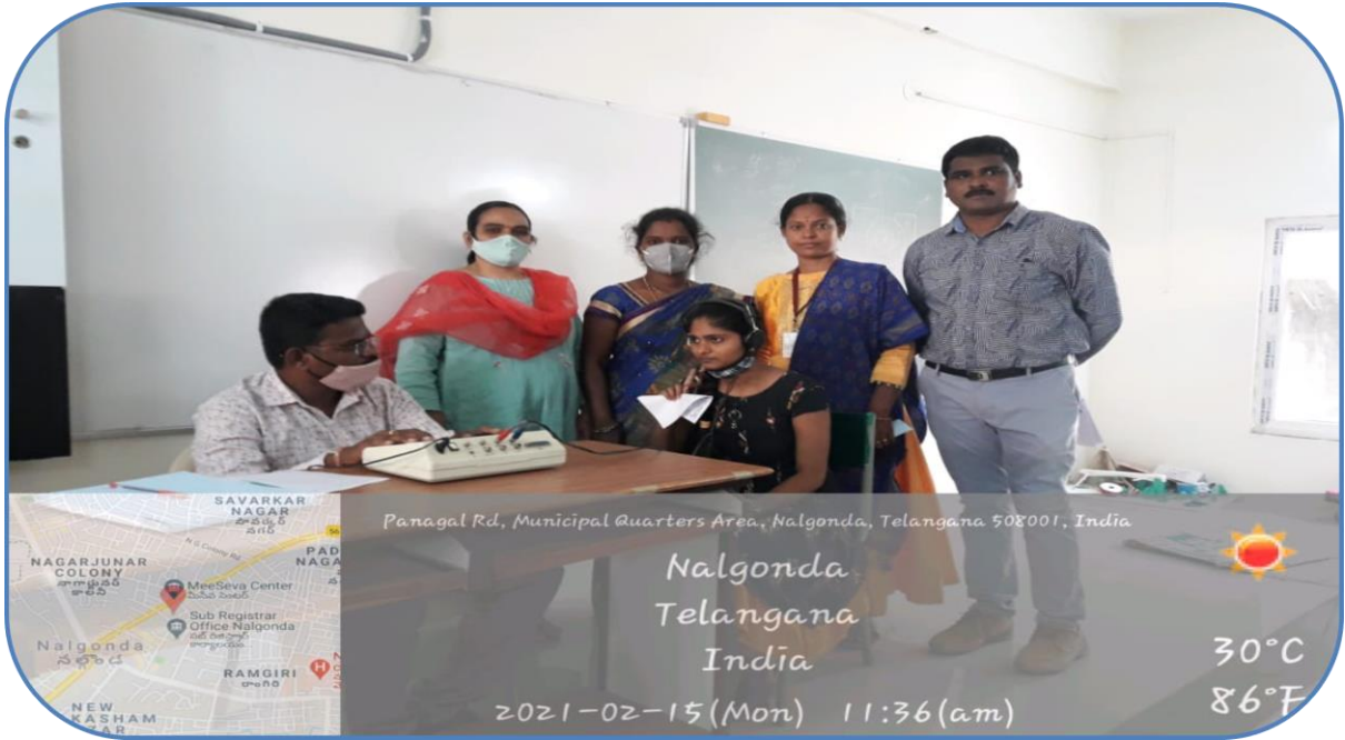
Volunteers at audibility check up