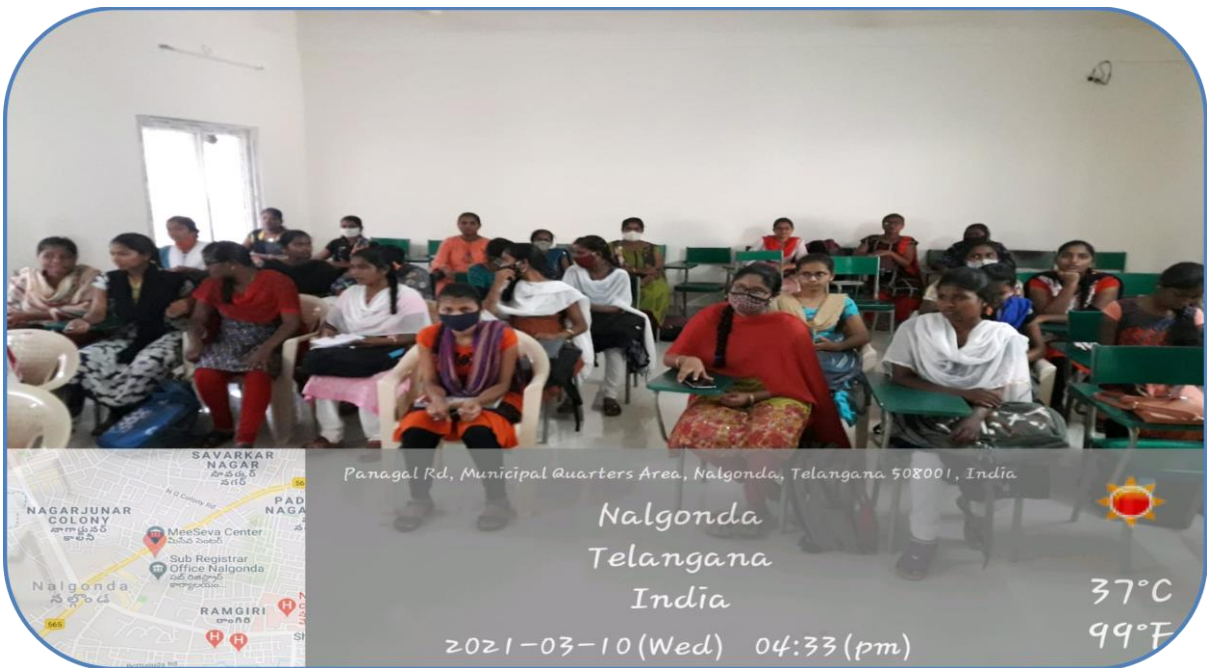
volunteers in Savitribai Phule vardhanthi