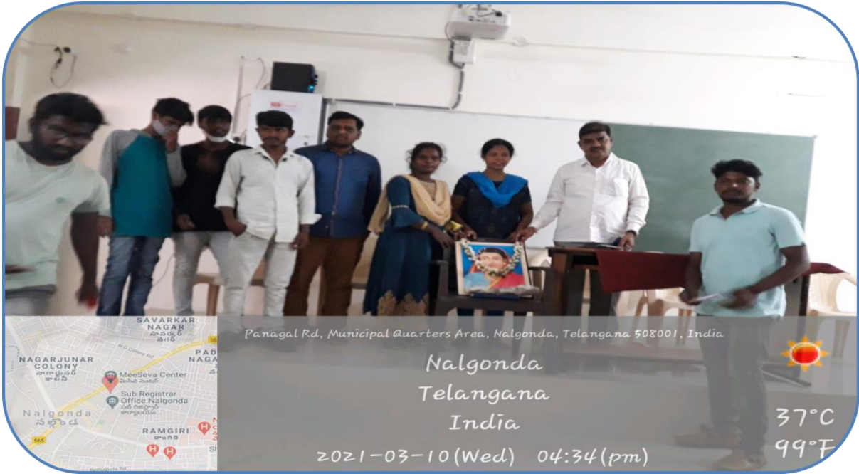
Savitribai Phule vardhanthi

On the occasion of Savithri Bhai Pule Jayanthi, National women's education day is celebrated on 10.03.2021. NSS PO's and staff members garlanded Savithri Bhai Pule potrait.