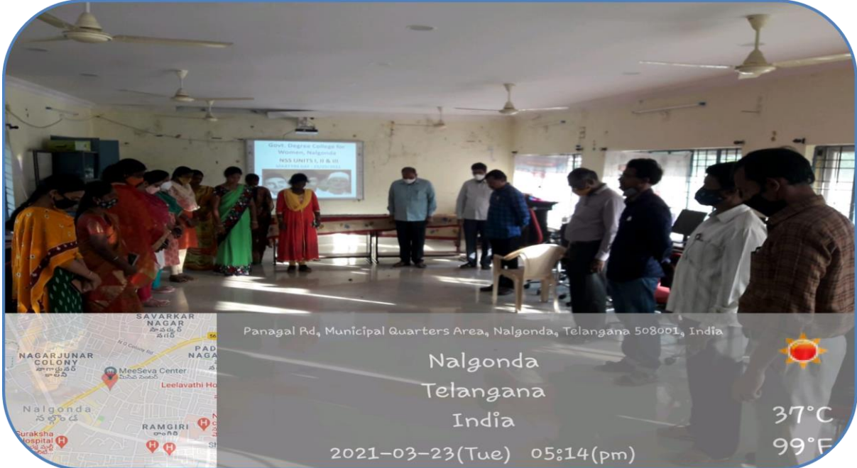
Staff observing silence for the freedom fighters