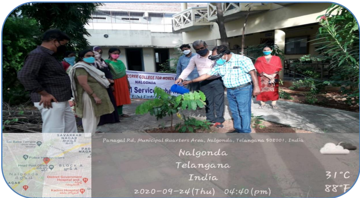
Plantation by NG college principal