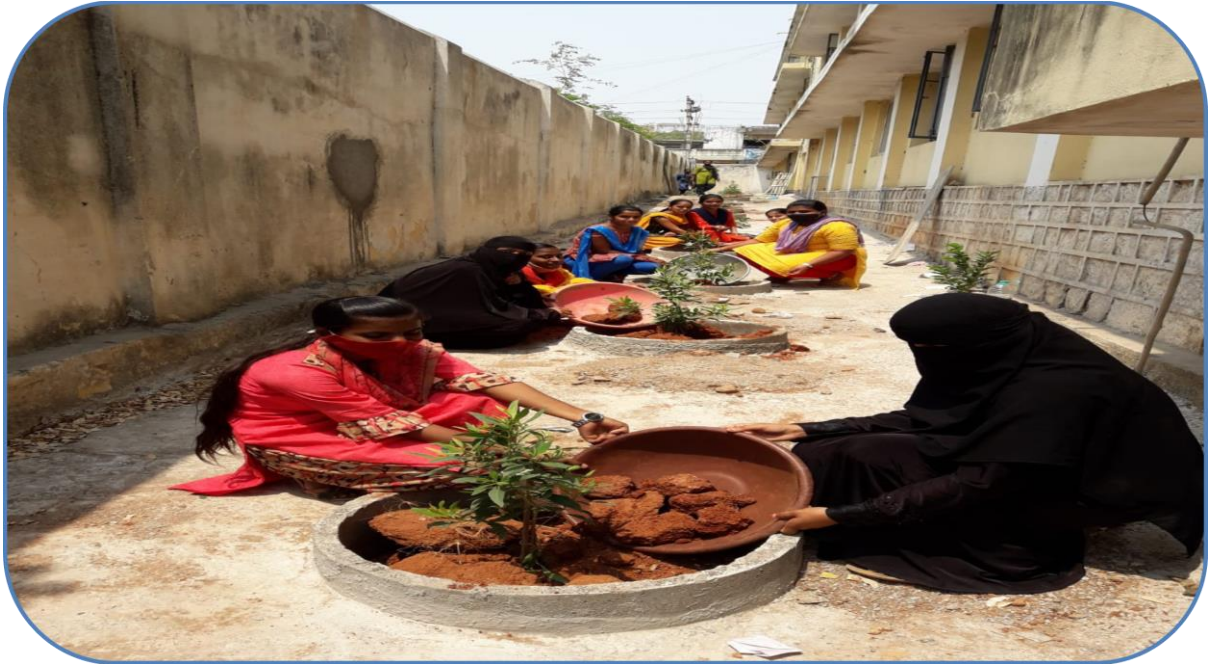
Volunteers filling the red soil