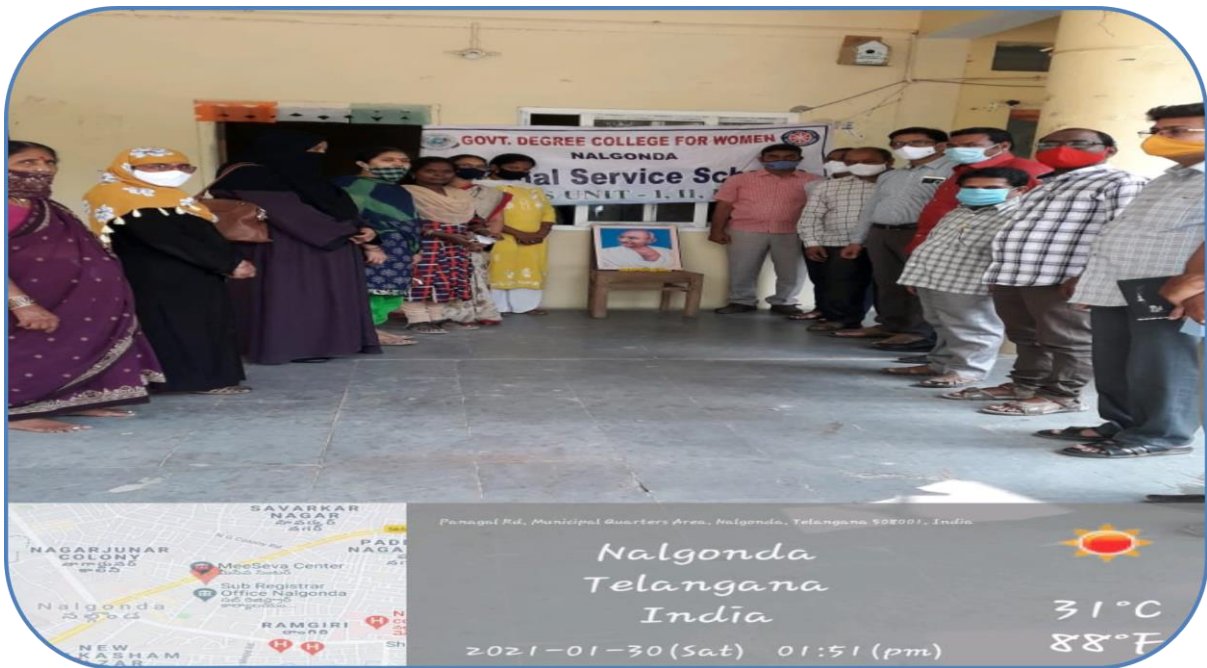
Staff garlanding Mahatma Gandhiji

All the staff members, NSS PO's and volunteers garlanded Mahatma Gandhi on his death anniversary on 30.01.2021.