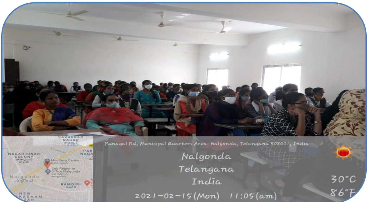
Volunteers at audibility check up