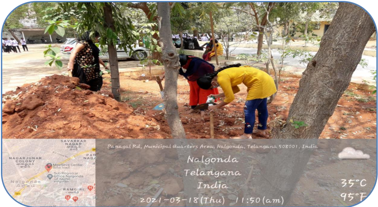
Volunteers spreading the red soil