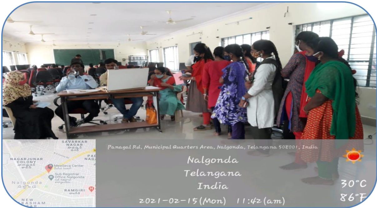
Volunteers at Eye check up