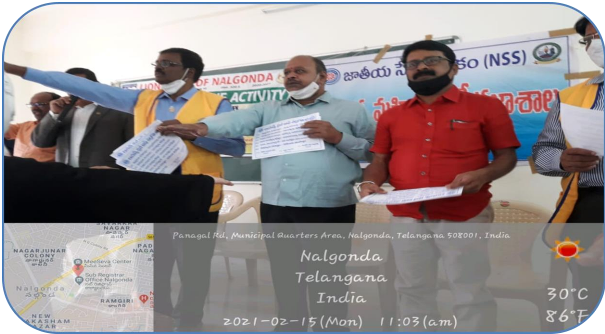
Volunteers and organizers taking oath on healthy India