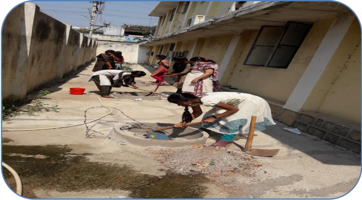
Volunteers Cleaning the Campus